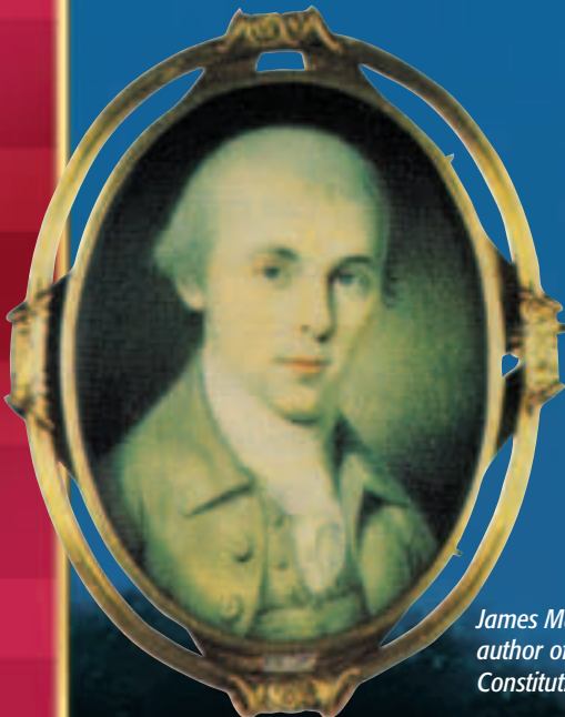
James Madison, author of the Constitution

The entire text of the Constitution and its amendments follows. Those passages that have been set aside, outdated by the passage of time, or changed by the adoption of amendments are printed in blue. Also included are explanatory notes that will help clarify the meaning of each article and section.