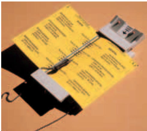
Ballot and ballot marker

Election of President and Vice President The Twelfth Amendment (1804) corrects a problem that had arisen in the method of electing the president and vice president. This amendment provides for the Electoral College to use separate ballots in voting for president and vice president. If no candidate receives a majority of the electoral votes, who elects the president?