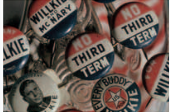
Presidential campaign buttons

Limit on Presidential Terms The Twenty-second Amendment (1951) limits presidents to a maximum of two elected terms. It was passed largely as a reaction to Franklin D. Roosevelt's election to four terms between 1933 and 1945.