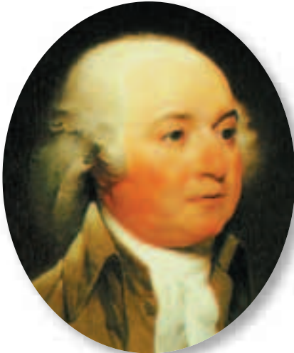
John Adams, the first vice president

Number of Members, Terms of Office, and Voting Procedure Originally, senators were chosen by the state legislators of their own states. The Seventeenth Amendment changed this, so that senators are now elected by the people. There are 100 senators, 2 from each state. The vice president serves as president of the Senate.