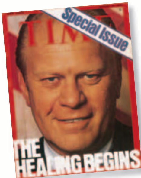
President Gerald Ford

This amendment was used in 1973, when Vice President Spiro Agnew resigned from office after being charged with accepting bribes. President Richard Nixon then appointed Gerald R. Ford as vice president in accordance with the provisions of the 25th Amendment. A year later, President Nixon resigned during the Watergate scandal and Ford became president. President Ford then had to fill the vice presidency, which he had left vacant upon assuming the presidency. He named Nelson A. Rockefeller as vice president. Thus individuals who had not been elected held both the presidency and the vice presidency. Whom does the president inform if he or she cannot carry out the duties of the office?