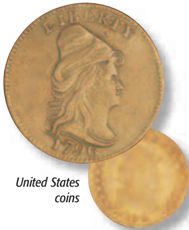
United States coins

Limitations on Power Section 10 lists limits on the states. These restrictions were designed, in part, to prevent an overlapping in functions and authority with the federal government.