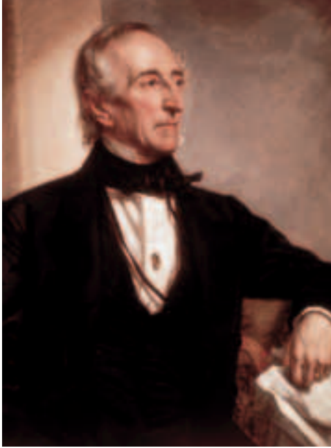
John Tyler was the first vice president to become president when a chief executive died.

Succession of President and Vice President This section provides that if the president-elect dies before taking office, the vice president-elect becomes president.