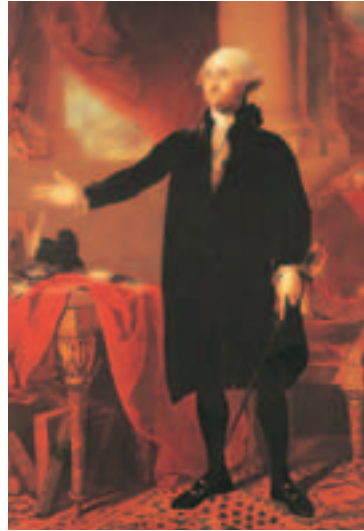
George Washington, the first president

Former Method of Election The Twelfth Amendment, added in 1804, changed the method of electing the president stated in Article II, Section 1, paragraph 3. The Twelfth Amendment requires that the electors cast separate ballots for president and vice president.