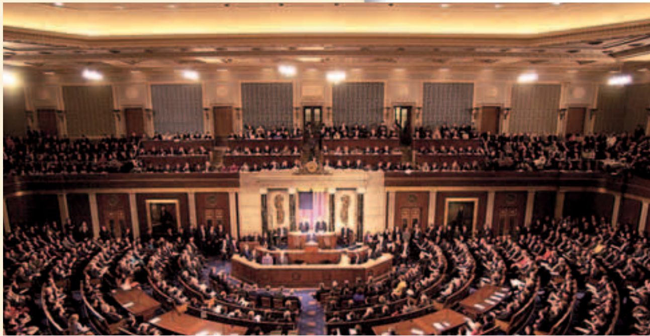
Joint meeting of Congress