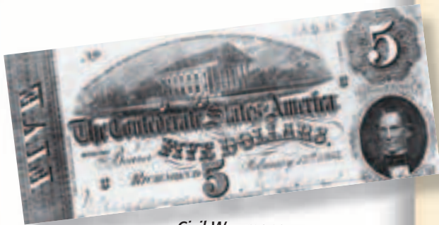
Civil War money

Expressed Powers Expressed powers are those powers directly stated in the Constitution. Most of the expressed powers of Congress are listed in Article I, Section 8. These powers are also called enumerated powers because they are numbered 1–18. Which clause gives Congress the power to declare war?